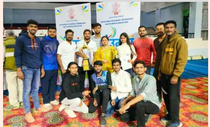
Winner Of SPNREC, Araria