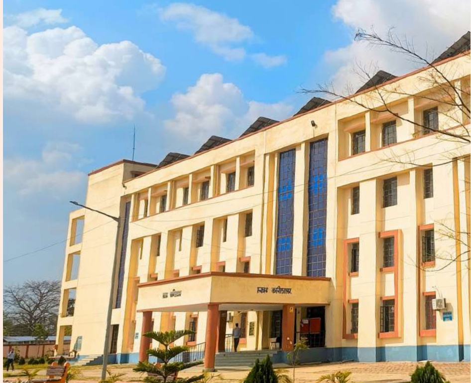
Shri Phanishwar Nath Renu Engineering College, Araria