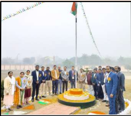
Flag Hoisting Ceremony

Overall, the Republic Day celebrations at Shri Phanishwar Nath Renu Engineering College, Araria were a resounding success, serving as a reminder of our shared identity as Indians and our collective responsibility to uphold the values of democracy, diversity, and dignity for all.