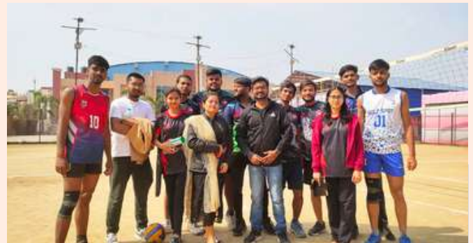
Winner from SPNREC, Araria

A total of 653 players of various sports selected at divisional level from various government engineering colleges and a total of 598 students from government polytechnic colleges participated in it. In the last two days, hidden qualities like team leadership, time management and leadership were seen in children in sports like cricket, volleyball, kabaddi, badminton, carrom, chess, table tennis, running, long jump, shot put, javelin throw, Discus throw etc. and meritorious students were awarded.