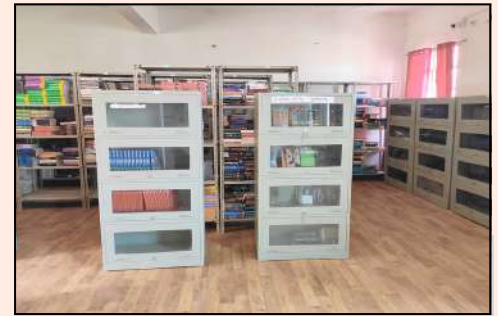
Renu Library: Collections

On the auspicious occasion of Renu Jayanti, we are proud to announce the tribute paid by our college, SPNREC, Araria to Respected Shri Phanishwar Nath Renu Ji. As a mark of reverence and appreciation for his invaluable contribution to Hindi literature, the institute has established a private library dedicated to Renu ji. This library will serve as a treasury of knowledge, which will have a collection of books written by Renu ji himself. By preserving and showcasing his literary works, we aim to inspire and empower our students to delve deeper into the rich tapestry of Renu ji's writings, gain valuable insights and assimilate timeless lessons that resonate with the essence of life. It is hoped that this initiative will serve as a beacon of knowledge and continue to promote the love of literature and learning among the generations to come.